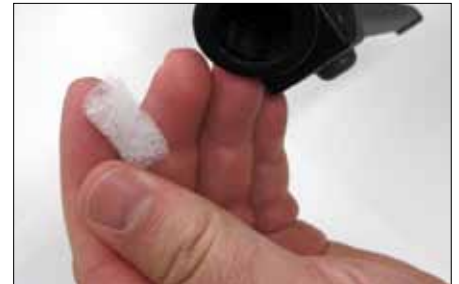
Step 4 Remove white waading from spray gun and dispose of waading (Item No.: WAAD-.5).