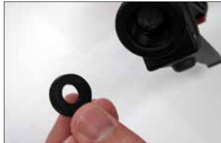
Step 3 Remove washer (Item No.: PSG75W) in spray gun. Washer may be reused if in good condition.