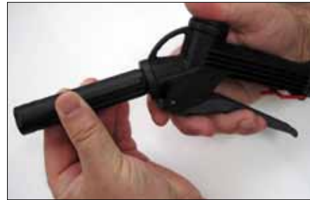
Step 1 Unthread poly wand from spray gun.