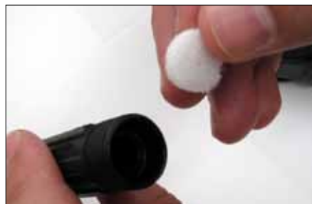
Step 6 Insert new waading in poly wand (ItemNo.: WAAD-.625).