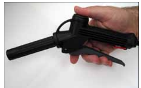
Step 7 Attach poly wand onto spray gun.