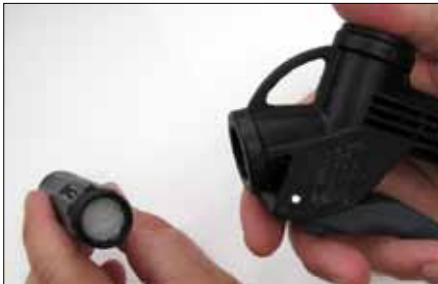
Step 2 Remove white waading in poly wand and dispose of waading (Item No.: WAAD-.625).