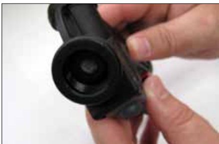
Step 5 Insert new waading (ItemNo.: WAAD-.5) and washer (ItemNo.: PSG75W) in spray gun.